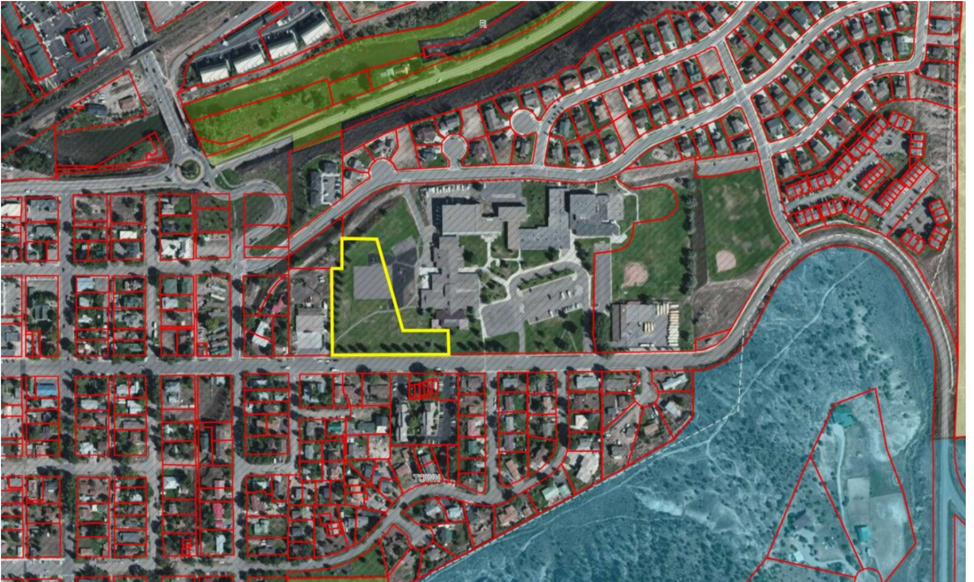
An aerial view map shows the location of the portion of public land that Eagle County Schools is looking to use to construct 16 new units of workforce housing in Eagle. If approved, the subdivision would be constructed at the west end of the school district's property off Third Street in Eagle next to the Greater Eagle Fire Protection District.

The development is planned for the west end of the school district's campus on Third Street and the units will be constructed in the form of eight duplexes, according to the sketch plan.